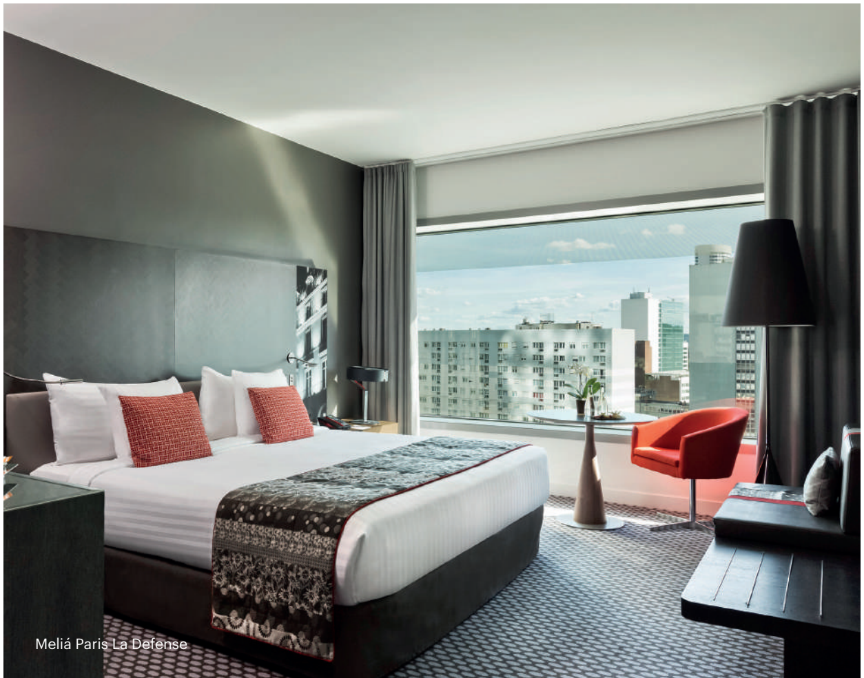
Meliá Paris La Defense