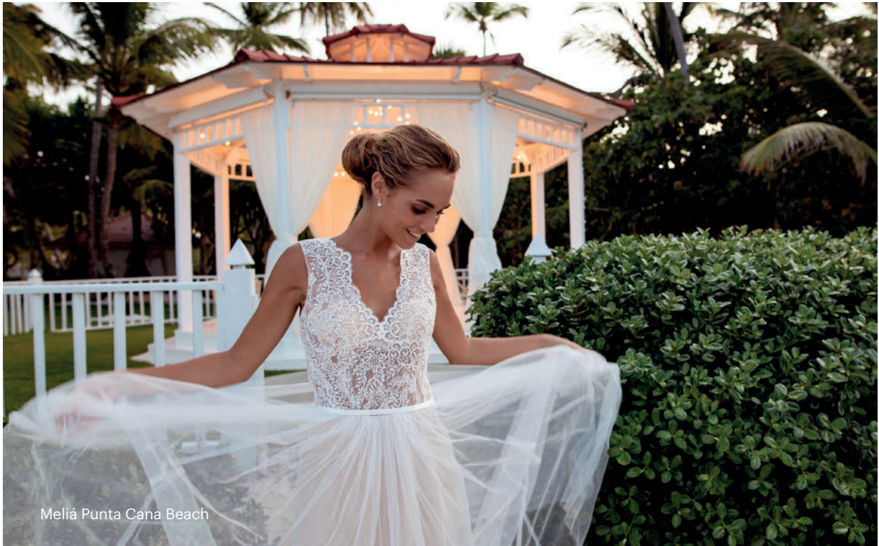
Meliá Punta Cana Beach