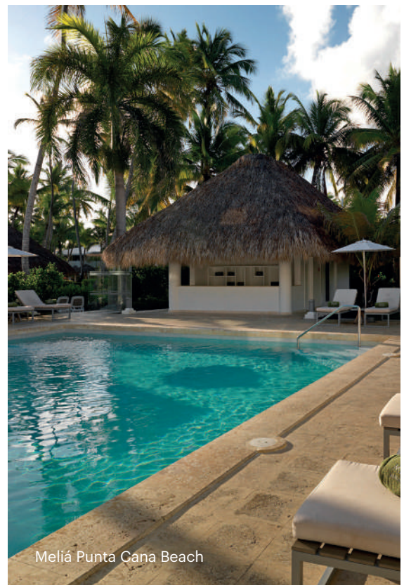
Meliá Punta Cana Beach

Exceeding expectations... at an all-inclusive price.